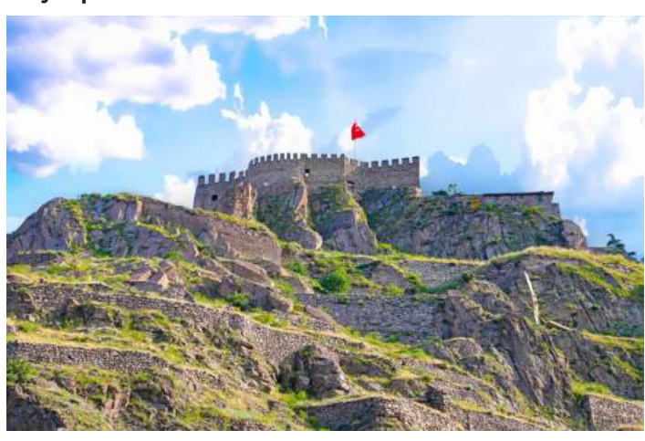
Day 3 | Cumalikizik and Gordion

Begin your day of culture in the charming village of Cumalikizik, with its traditional wooden houses and very narrow cobblestone streets. Later you'll head to Gordion, which was once the capital city of ancient Phrygia, as you make your way to Turkey's modern capital, Ankara. Enjoy a relaxed evening at your hotel, the Hilton SA. Perhaps take a dip in its indoor pool or unwind in its jacuzzi or hammam.