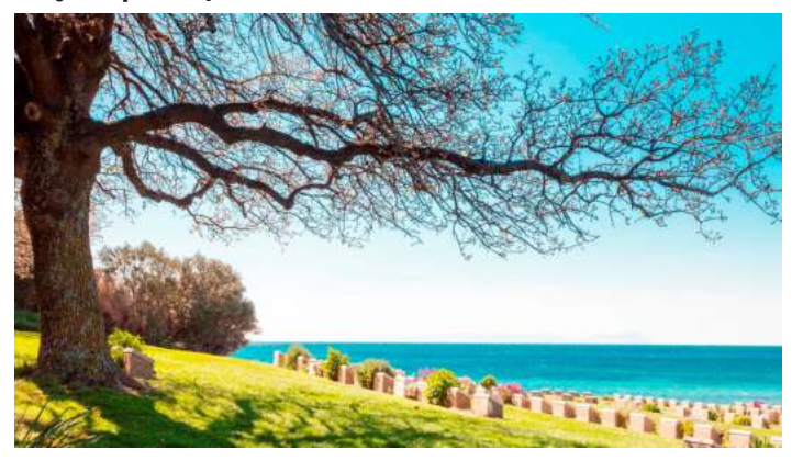
Day 13 | Gallipoli and ANZAC Cove

This morning, cross the Dardanelles Strait by ferry to the Gallipoli Peninsula. Located in the southern part of East Thrace, it was here that, for nine months during the Great War, Anzac troops fought, in an attempt to gain control of the Dardanelles Strait. Learn more about these events as you visit Anzac Cove and pay your respects at the Lone Pine Cemetery. Later, return to Istanbul where you'll spend the next two nights.