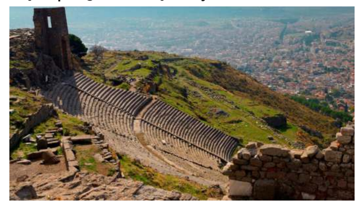
Day 12 | Pergamon, Troy and Çanakkale.

Begin your day of legends with a trip to Pergamon. Once a powerful ancient Greek city, you'll find the Asklepion temple here. A famous shrine and healing centre, it was built in honour of Asklepios, the god of medicine. Next, head to Homer's city of Troy, the focal point of the Trojan war and the backdrop to one of history's most famous love stories, that of Paris and Helen of Troy, the face that launched 1000 ships. A replica of the mighty Trojan Horse, which helped the Greeks capture the city in 1200 B.C., can be found beside the city's walls. After some time exploring, continue your journey to Çanakkale, a gateway to the Gallipoli WWI battlefields.