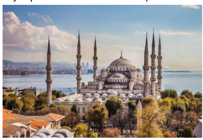
Day 14 | Istanbul and the Ottoman Empire

Today you'll take in the sites of Istanbul. In the morning, visit the historic Blue Mosque and the Hippodrome, where Roman chariot races were held, before exploring Hagia Sophia. Built in A.D. 537, it has recently turned from a museum into a mosque and is famous for its domed roof. Visit the Topkapi Palace, perched above the Bosphorus and the Golden Horn, the primary inlet of the waterway. Enjoy the excitement of bargaining in the bustling Grand Bazaar. In the evening, join your fellow travellers and toast to your trip over a Celebration Dinner at a local restaurant.