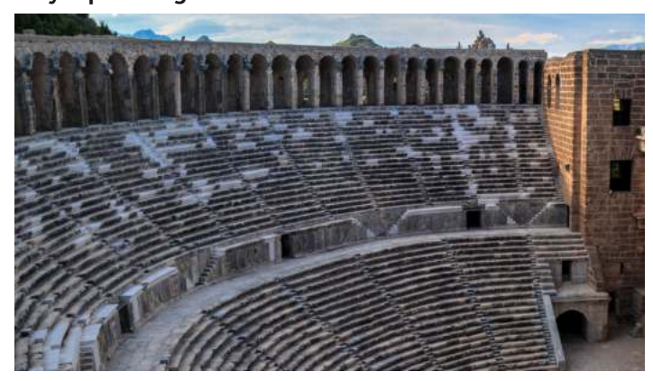
Day 7 | Through the Taurus Mountains

You day begins with a scenic drive down the Taurus Mountains to Aspendos, an ancient city in Antalya. Known for having the best-preserved Roman theatre anywhere in the world, learn more as you explore it with your fellow travellers. Continue to your hotel for the next two nights and enjoy time to relax.