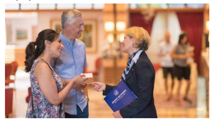
Join your Travel Director and fellow guests for your Welcome Reception, with the opportunity to mingle over a pleasant evening of good food.