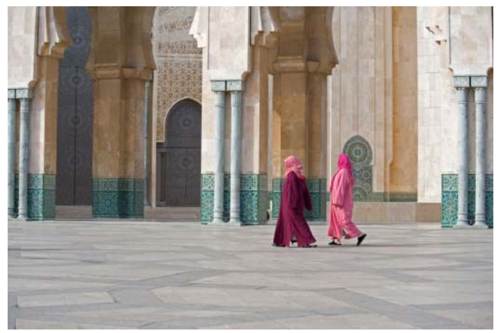
Day 11 | Au revoir Casablanca

Today, bid farewell to your journey along Morocco as you transfer to the airport.