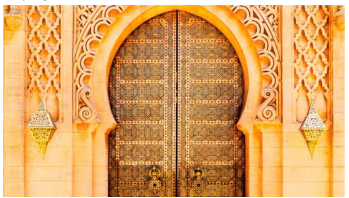
Day 2 | Rabat, Imperial Meknes and Fes

During an exploration of the sights of Casablanca view the huge Hassan II Mosque, the largest in the country. Venture to the très chic seaside strip known as the Corniche, which stretches to the west and is lined with trendy restaurants and cafes. Depart for the capital of Rabat to see the Royal Palace, Hassan Tower and visit one of the few holy places open to non-Muslims, the lavish Mausoleum of King Mohammed V. This site is both an architectural marvel and a monument to a great ruler. Travel to Meknes, one of the kingdom's great imperial cities where little has changed since its founding in the 11th century. Stand before the Bab el-Mansour, the monumental entrance to the imperial city and focal point of Square El-Hedim, before continuing to Fes.